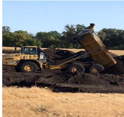
Sept 5/18 SSKP 1042