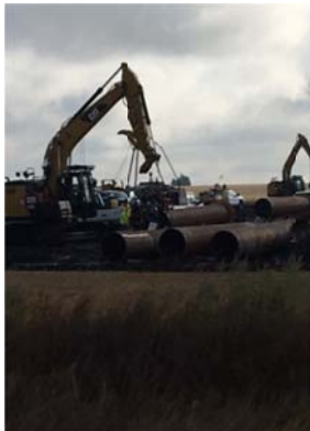
Sept 7/18 Kick off sskp 1000+000