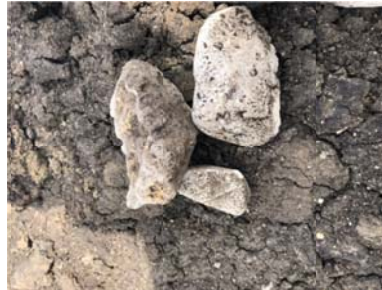
Sept 7/18 Bones SSKP 1041