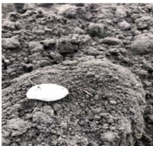
Sept 7/18 Smaller stone along the river vs. on the ridge