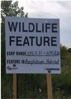
Sept 4/18 1057.11+1057.22 Bones located in the area