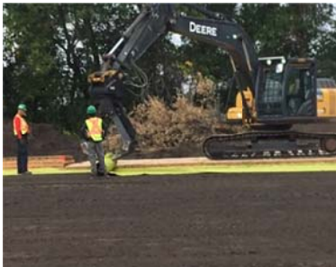
Sept 6/18 1041+000 SSKP