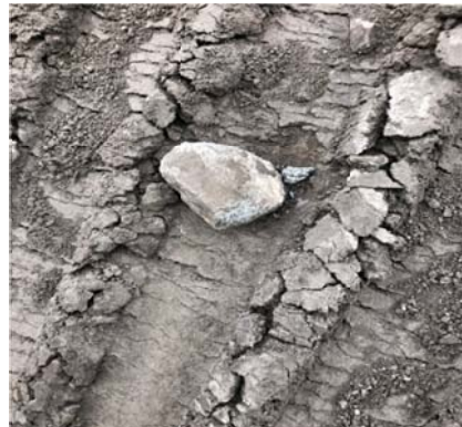
Sept 7/18 smaller stone SSKP 1041